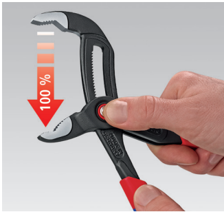
Press the button – open pliers completely