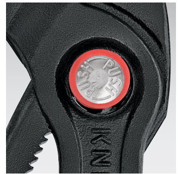
Cobra® QuickSet – Push-button